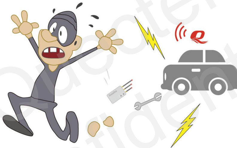
Figure 1: Jamming Application Diagram

Quectel's Jamming Detection allows the user to identify active jamming of the GSM network. Many alarm, security and life critical operations rely on the use of GSM mobile communications. Criminals and those that intent on preventing time critical messages may use GSM Jammers to interfere with normal network operation. Quectel's Jamming Detection can allow Quectel module to detect GSM jamming signals. When jamming is detected, Quectel module sends a notification to MCU, reporting the presence of active jamming of the GSM mobile communication network.